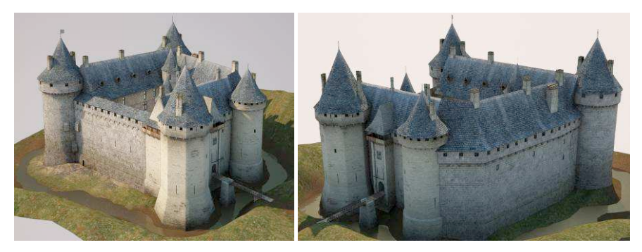
Fig. 3. 3D renderings showing northern and western parts surrounded by ground and moat

In order to produce a mesh of the surrounding castle grounds inclusive in particular of the the moat, two solutions had been considered: to build a mesh from the point cloud resulting from laser scanning or directly use a mesh from a ten years old topographic survey. This last solution was adopted because the mesh is not very dense and untouched by any intrusive vegetation. It was thus easy to handle and it required just a simple vector smoothing to obtain satisfactory results. This topographic survey was conducted in 2005 by civil engineering students and was commissioned by an archaeologist. Two total stations Leica TC1100 and TC705 were used for the survey; isometric curves and a mesh were generated using the Covadis software and were easily imported through 3DSmax with great assistance of the model's .dwg file format.